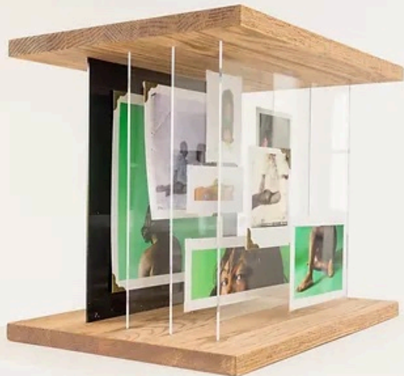
Album Reconstruction no 1. (Carolyn and I), 2022

Mixed Media Sculpture (Oak, Acrylic sheets, Type I Instant Film, Ink on Archival Paper, and Bronze photo corners)