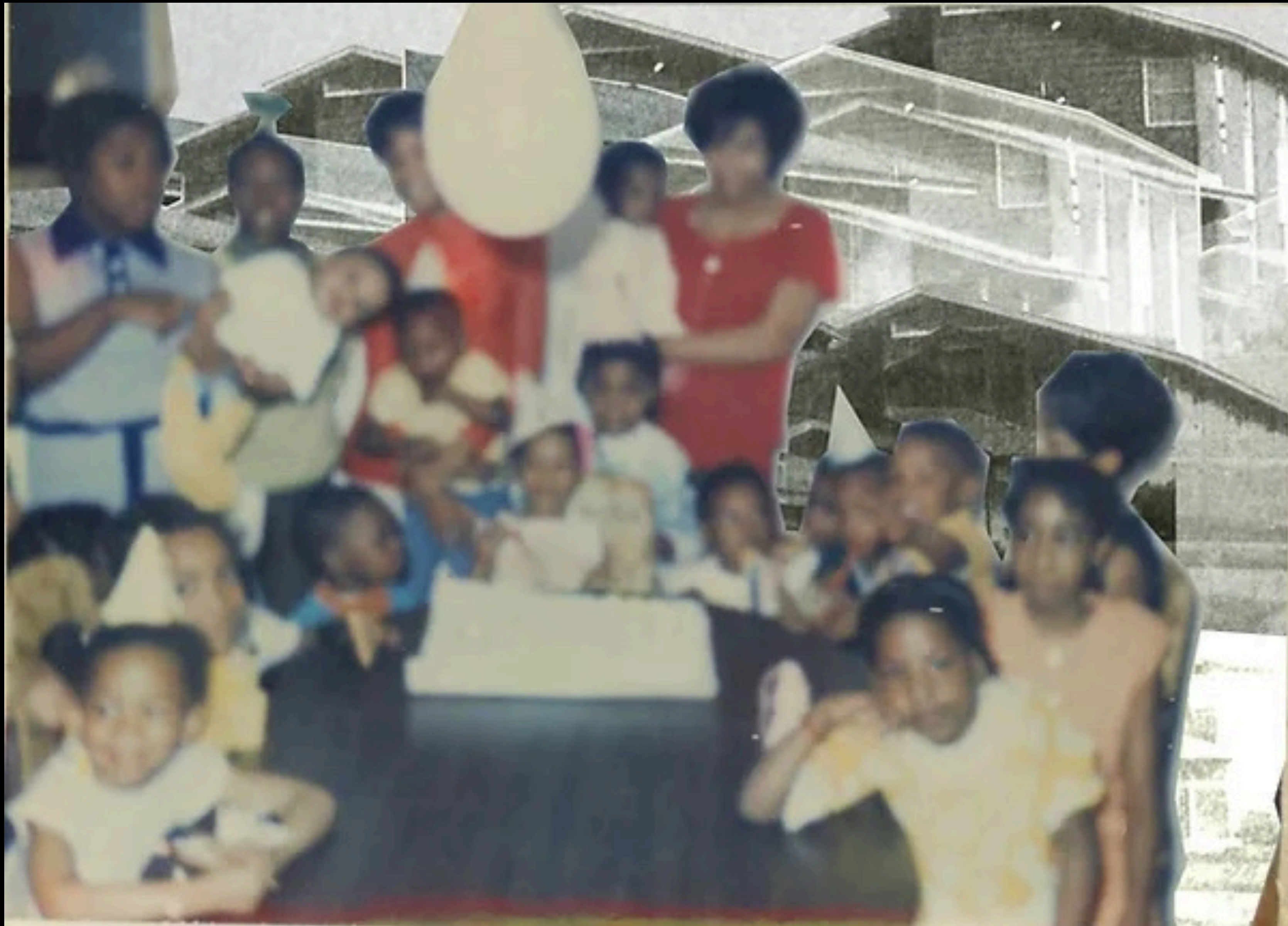
Kinloch Study no. 4 (A Birthday Celebration), 2019