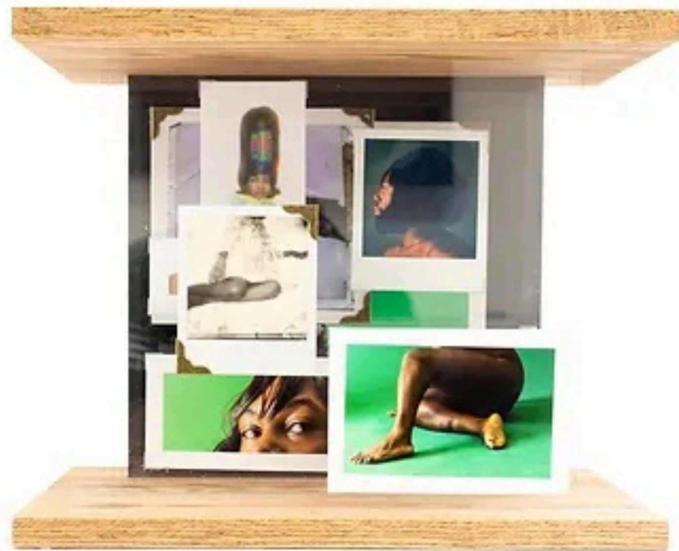
Album Reconstruction no 1. (Carolyn and I), 2022

Mixed Media Sculpture (Oak, Acrylic sheets, Type I Instant Film, Ink on Archival Paper, and Bronze photo corners)