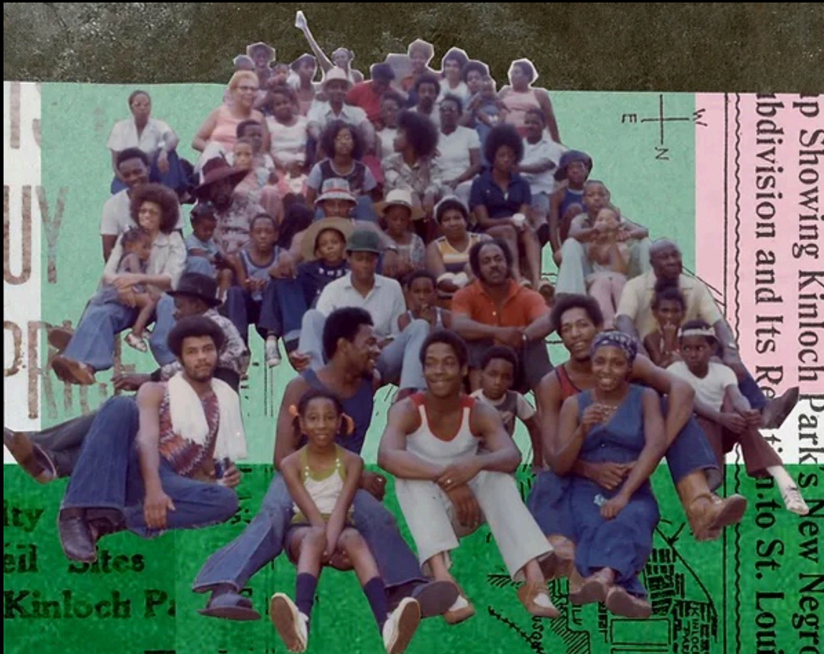
Kinloch Study no. 6 (Bennett Family Reunion at Kinloch Park), 2019