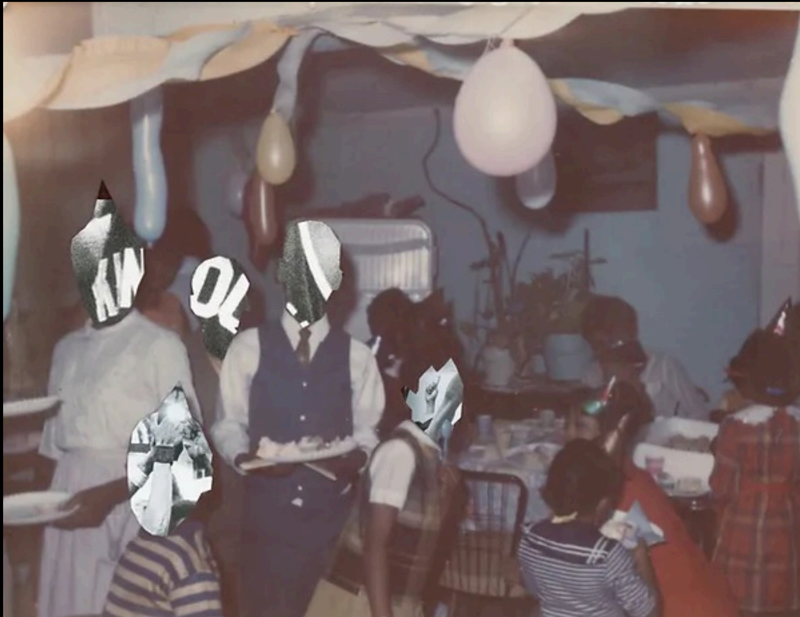
Kinloch Study no. 5 (Gestures of Refusal), 2019