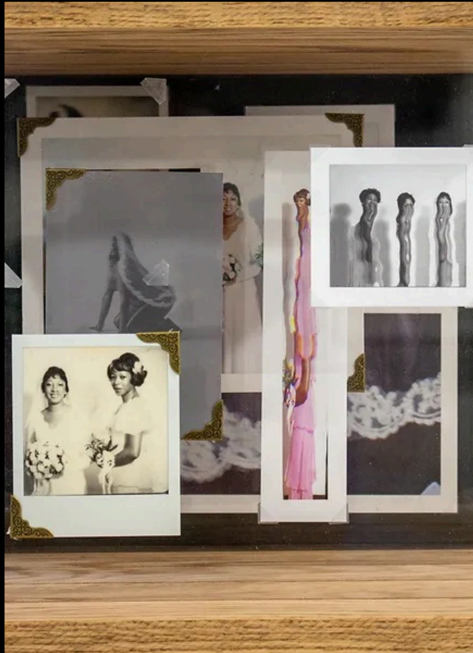
Album Reconstruction no 2. (Matriarchs and Matrimony), 2022

Mixed Media Sculpture (Oak, Acrylic sheets, Type I Instant Film, Ink on Archival Paper, and Bronze photo corners)